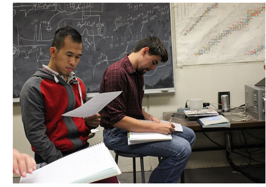
Students hard at work in a nuclear engineering lab.