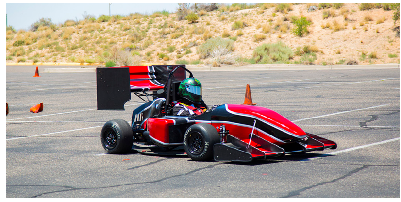
The award-winning Formula SAE program.